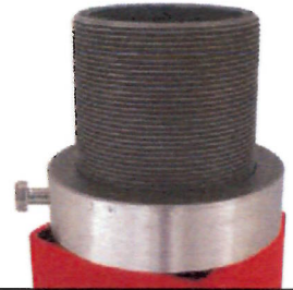
Lock Bolt and Adjustment Assembly