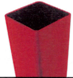
Square Tube Design